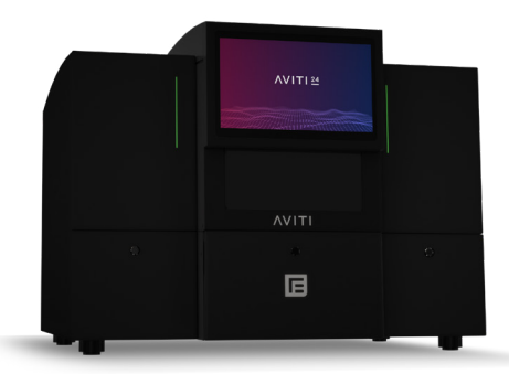
Figure 1. AVITI24 unites the diverse worlds of molecular biology and cell imaging on one compact benchtop system.

The AVITI24 can detect thousands of transcripts per cell and billions of high-quality transcripts in situ on one Teton flow cell for sensitive detection of genes across a range of expression levels, fueling high-resolution cell typing and pathway analysis.